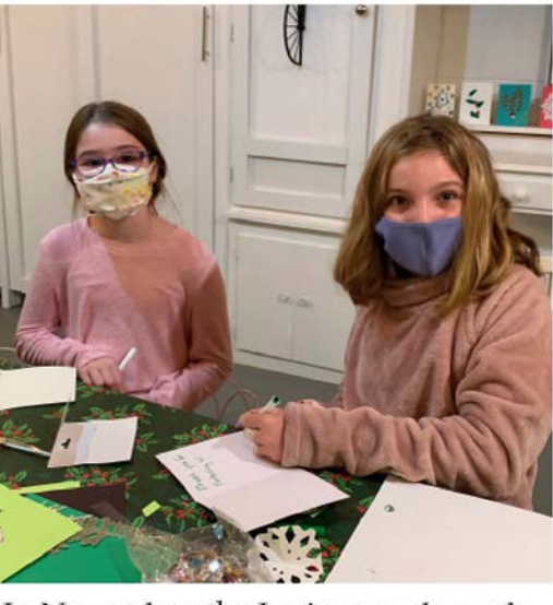
In November, the Juniors made cards to be added to holiday gift bags put together by the Rake & Hoe Garden Club for the veterans at the Lyons Veterans Hospital