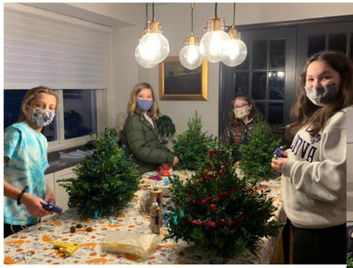
The Juniors learned how to make a tabletop boxwood tree to take home for the holidays.