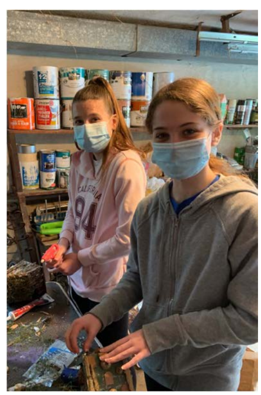
Using a wooden birdhouse as a base, the Juniors decorated the houses using all natural materials.